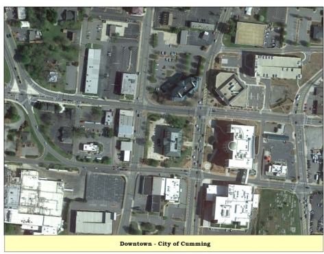
Downtown - City of Cumming

Forsyth County acquired 6" pixel resolution orthophotography as a participant in the 2018 GMRC Aerial Photography Project. The flight took place during leaf off season of February through March 2018. The entire county was flown with a 500' buffer around the county boundary. Forsyth County also committed to participate in the grant application submitted to USGS for the acquisition of QL2 LiDAR (Light Detection and Ranging). Forsyth County was one of 67 county participants in the grant application through the State of Georgia's Geospatial Information Office.